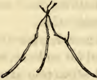
AS THE FIRST THREE LOOKED

We reached the lake at noon and it seemed as if we might soon have time to sit down and rest. But there was a great deal to do. Aggie was of no assistance on account of her arms, so Tish and I put up the tent. The "Young Woodsman" said it was easy. First you tied three long poles together near the top and stood them up so they made a sort of triangle. Then you cut about a dozen and filled in between the three. That looked easy, but it took an afternoon, and our first three looked like this first cut.